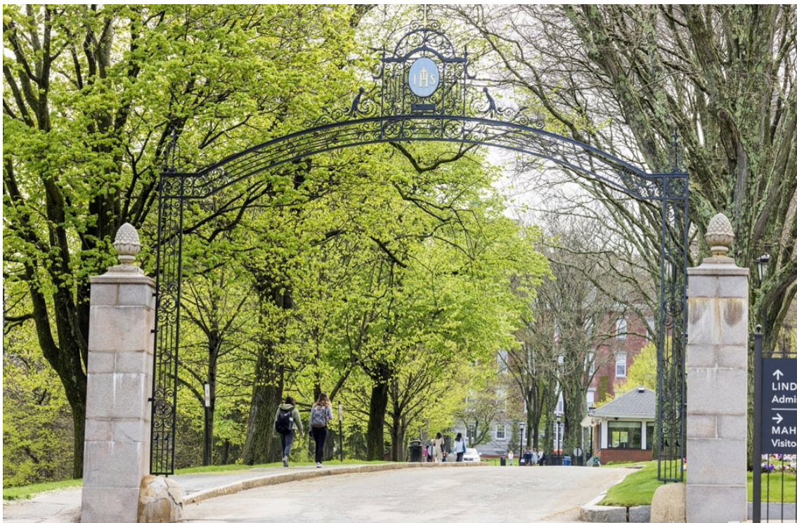
Photo of Linden Lane from College Street

Driving Directions: Please navigate to campus based on your preferred navigation app: Apple Maps (mobile use only), Google Maps , Waze , or enter 1 College St, Worcester, MA 01610 into your navigation system. Drivers will enter campus at the Linden Lane Gate on College Street (Gate 2) as pictured below.